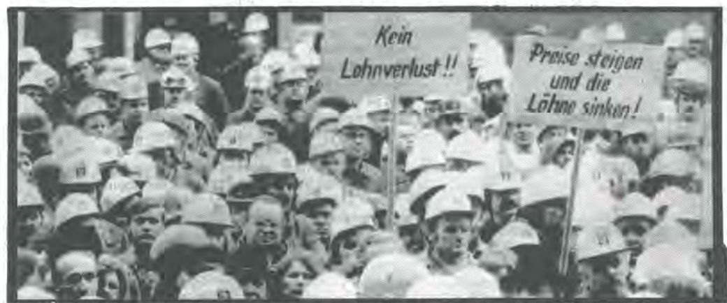
Engineers from Stuttgart on an afternoon "warning strike" last Februrary. The slogans on the placards read: "No drop in wages!" and "The prices rise and the wages sink!"

The problem therefore is how do revolutionaries relate to this existing level of consciousness of the working class and popularise their programme for the revolutionary overthrow of capitalism as the only way of solving the problems of the the working class.