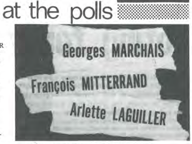
French workers could not endorse the programmes of any of these parties. In round one, they could only refuse to choose and register their protest with a spoilt ballot.